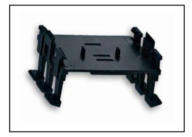
Fig. 3 Modular bracket – HC922