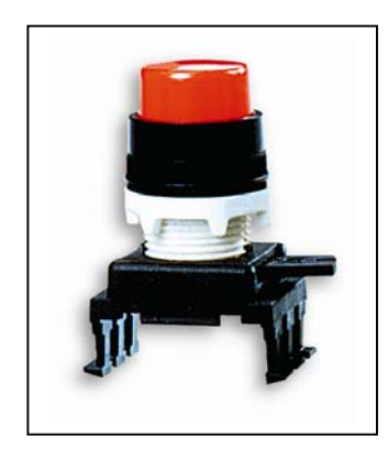
Fig. 2 Drive with outstanding button Bi-stable HF45C

special rotatory lever , and to the bracket to press (latched) the suitable quantity of NO and NC connectors (Fig. 4) or the modular bracket for light sources - HC61 (Fig. 5). Connecting set can be composed from one, two or three connectors arranged in tiers. If we want to obtain the backlit button , then with the central element in the set should be the bracket for light sources. To connect second and next tiers for the purpose of making vertical cascade , serve special HC1 brackets (Fig. 6). One can build also the horizontal cascade using NO and NC connectors. This can be achieved using side-bracket HC9 (Fig. 7). For every tier of connectors one can be used just one NO oe NC connector installed side by side. For backlit buttons and signaling lamps are light sources - BA9S bulbs (max. 11x28)- with maximum power 2, 6W and voltage - 6V, 12V, 24V, 48V, 110V and 230V. ETISIG system uses two kinds of signaling lamps- modular HBO (Fig. 8) fastened on brackets, and integrated LED (Fig. 9) fastened directly in the assembly- opening with the diameter Ř 22, 3 mm. A light source integrated in lamps is electroluminescence diode LED with rated voltage AC /DC 12V, 24V, 48V, 110V, 240V. Both have two kinds of shining lenses : smooth and notched.