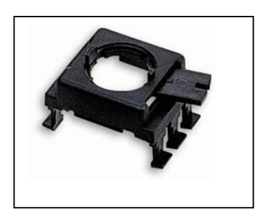
Fig. 5 Bracket for light sources - HC61